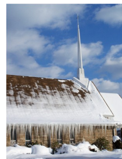
Icy, Cold and Snowy Winter is finally over!

will be held on... Wednesday May 5, 2010 at 6pm at the church. Reservation deadline is Sunday April 25th. Cost is $10 for adults and $6 for children 12 and under. Checks should be made payable to the church.