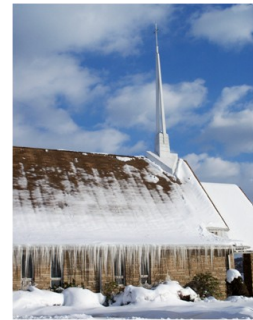
Icy, Cold and Snowy Winter is finally over!

will be held on... Wednesday May 5, 2010 at 6pm at the church. Reservation deadline is Sunday April 25th. Cost is $10 for adults and $6 for children 12 and under. Checks should be made payable to the church.